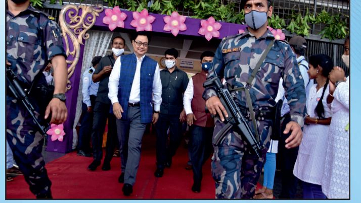
ಶಿಲಾನ್ಯಾಸ ಸಮಾರಂಭಕ್ಕೆ ಕೇಂದ್ರ ಸಚಿವರ ಆಗಮನ