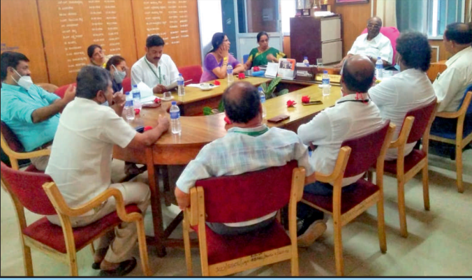
ಸಹ್ಯಾದ್ರಿ ವಿಜ್ಞಾನ ಕಾಲೇಜಿನ ಹಿರಿಯ ವಿದ್ಯಾರ್ಥಿಗಲ ಕಾರ್ಯಕಾರಿ ಮಂಡಲ ಸಭೆ