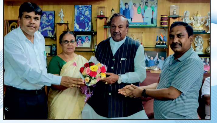
ಜಿಲ್ಲಾ ಉಸ್ತುವಾರಿ ಸಚಿವರಿಗೆ ಅಭಿನಂದನೆ