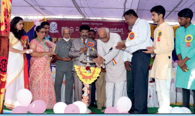
ವಿಜ್ಞಾನ ಪರಿಷತ್ ಉದ್ಘಾಟನಾ ಸಮಾರಂಭ