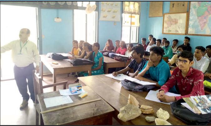
ಭೂವಿಜ್ಞಾನ ವಿಭಾಗದಿಂದ ಉಪನ್ಯಾಸ