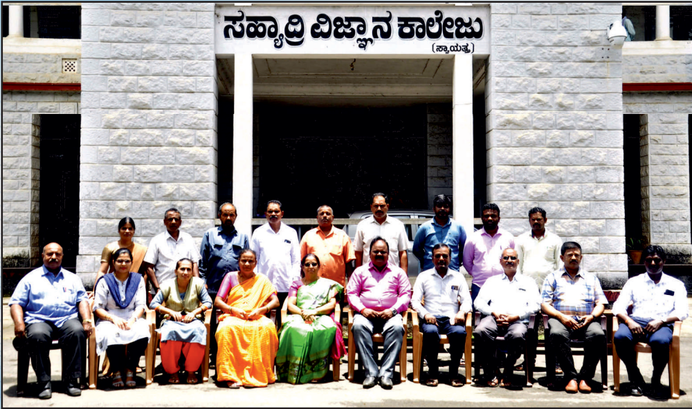
NON TEACHING STAFF