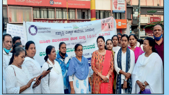
ವಿಶ್ವ ಮಹಿಲಾ ದಿನಾಚರಣೆ