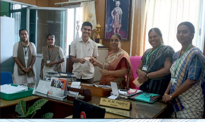
ಐ.ಕ್ಯೂ.ಎ.ಸಿ. ವತಿಯಿಂದ ನಡೆದ ಪತ್ರಲೇಖನ ಸ್ಪರ್ಧೆಯಲ್ಲಿ ವಿಜೇತರು