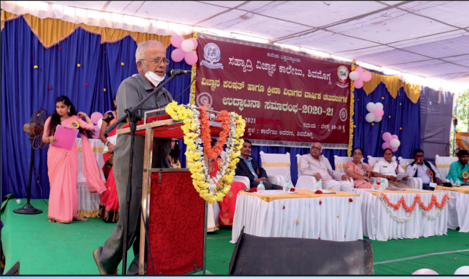
ಮುಖ್ಯ ಅತಿಥಿಗಳಿಂದ ಭಾಷಣ