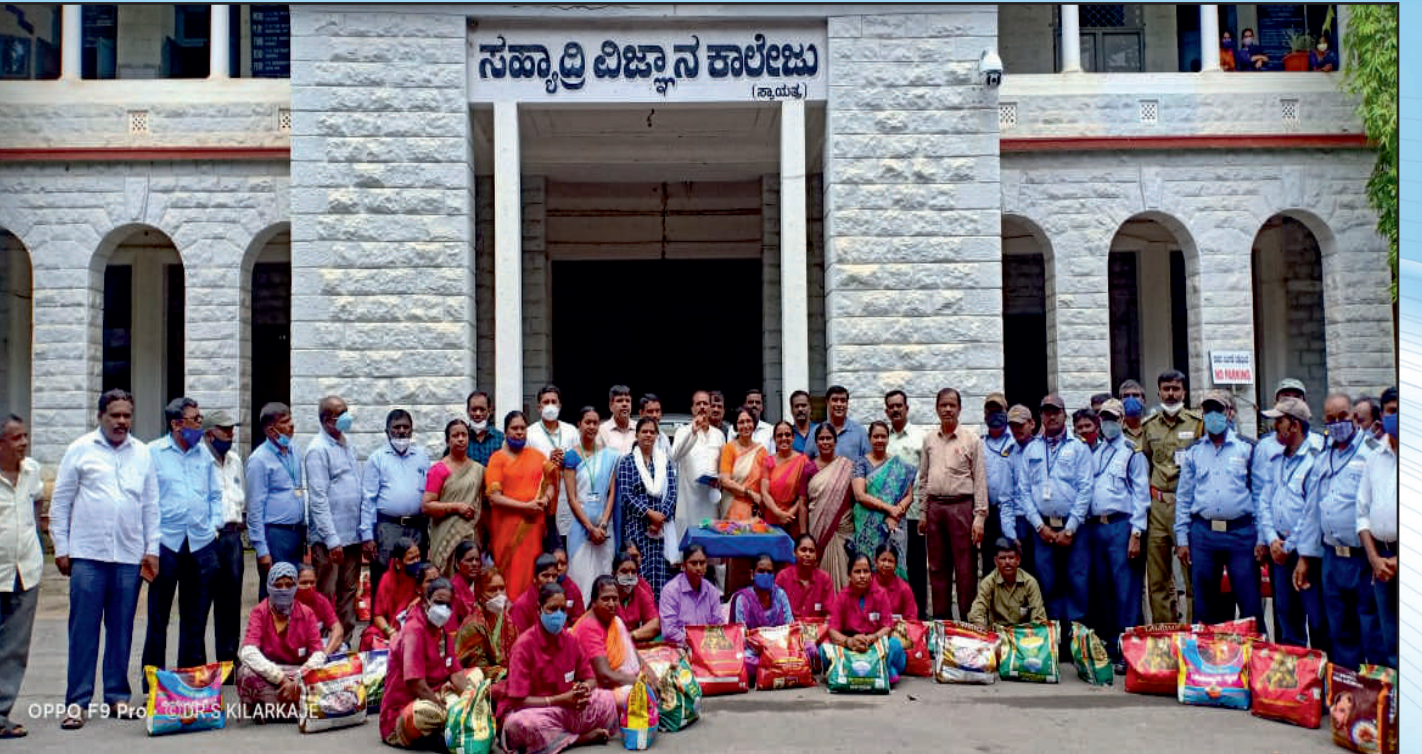
ಡಿ. ದರ್ಜೆ ನೌಕರರಿಗೆ ಕಾಲೇಜಿನ ಶಿಕ್ಷಕ ವೃಂದದವರಿಂದ ಆಹಾರ ಕಿಟ್ ವಿತರಣೆ