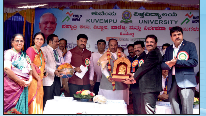
ಶಿಲಾನ್ಯಾಸ ಸಮಾರಂಭದಲ್ಲಿ ಸಚಿವರಿಗೆ ಸನ್ಮಾನ