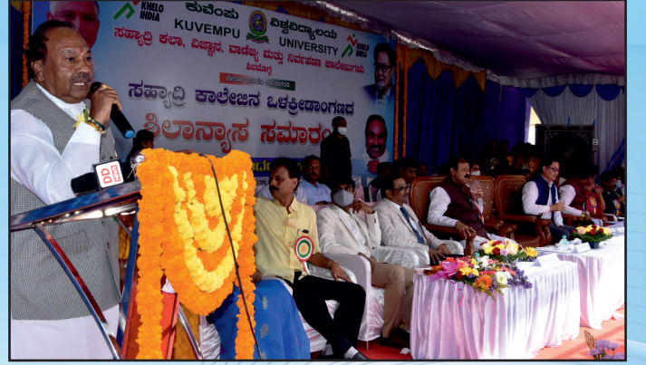
ಮುಖ್ಯ ಅತಿಥಿಗಳಿಂದ ಭಾಷಣ