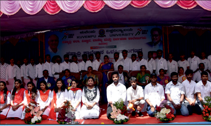
ಶಿಲಾನ್ಯಾಸ ಸಮಾರಂಭದಲ್ಲಿ ಕಾಲೇಜು ವಿದ್ಯಾರ್ಥಿಗಳು