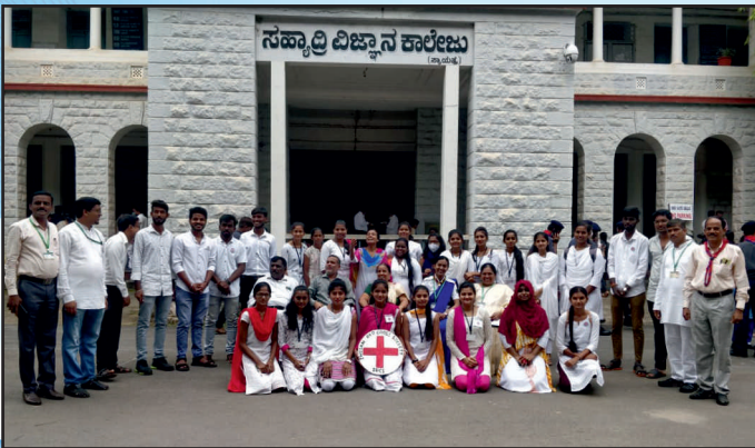
ಸ್ವಾತಂತ್ರ್ಯೋತ್ಸವ ದಿನಾಚರಣೆಯಲ್ಲಿ ರೆಡ್ ಕ್ರಾಸ್ ಸದಸ್ಯರು