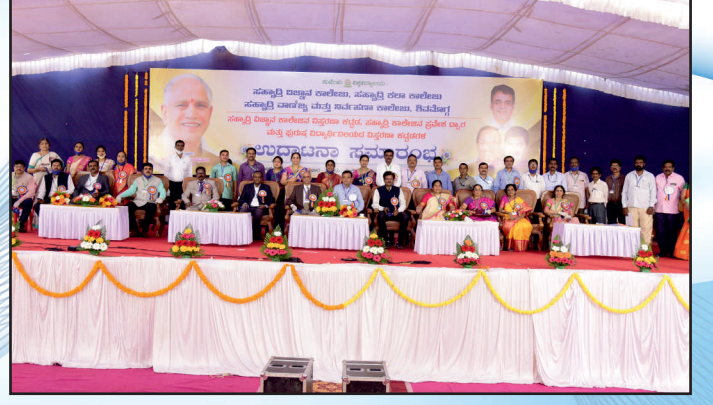
ಒಳಾಂಗಣ ಕ್ರೀಡಾಂಗಣ ಉದ್ಘಾಟನಾ ಸಮಾರಂಭ