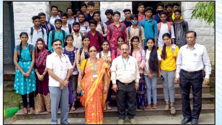
ಡಿ.ವಿ.ಎಸ್. ಪಾಲಿಟೆಕ್ನಿಕ್ ವಿದ್ಯಾರ್ಥಿಗಳು ಭೂ ವಿಜ್ಞಾನ ವಿಭಾಗಕ್ಕೆ ಬೇಟಿಕೊಟ್ಟ ಸಂದರ್ಭ