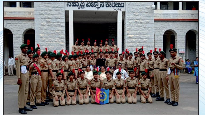
ಸ್ವಾತಂತ್ರ್ಯೋತ್ಸವ ದಿನಾಚರಣೆಯಲ್ಲಿ ಎನ್.ಸಿ.ಸಿ. ಕೆಡಿಟ್ಸ್