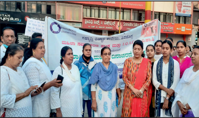
ವಿಶ್ವ ಮಹಿಳಾ ದಿನಾಚರಣೆ