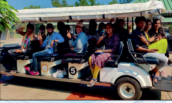
ಪಾಢ್ಲೇಸ್ ವಿದ್ಯಾರ್ಥಿಗಲಿಂದ ಪಿಲಿಕುಳ ನಿಸರ್ಗಧಾಮಕ್ಕೆ ಬೇಟೆ