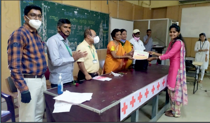
ರೆಡ್ ಕ್ರಾಸ್ ವತಿಯಿಂದ ಪ್ರಮಾಣಪತ್ರ ವಿತರಣೆ