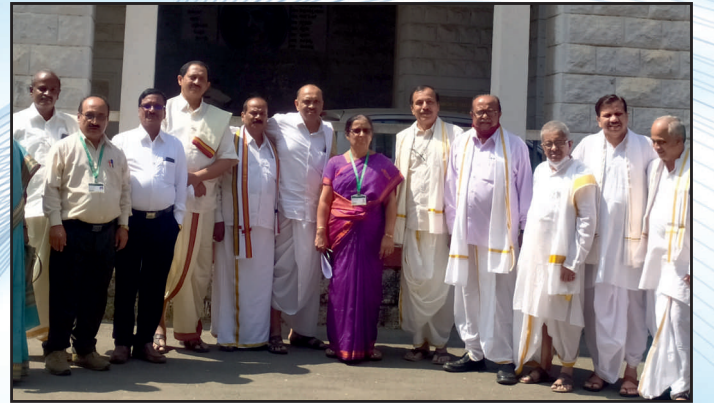
ಕಾಲೇಜಿನ ಹಿರಿಯ ವಿದ್ಯಾರ್ಥಿಗಳು ಬೇಟೆ ನೀಡಿದ ಸಂದರ್ಭ