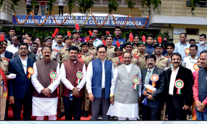
ಶಿಲಾನ್ಯಾಸ ಸಮಾರಂಭದಲ್ಲಿ ಅತಿಥಿಗಳು