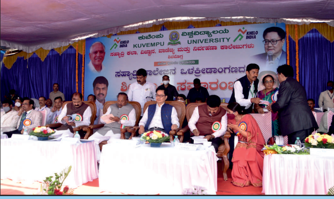
ಶಿಲಾನ್ಯಾಸ ಸಮಾರಂಭದಲ್ಲಿ ಅತಿಥಿಗಳು