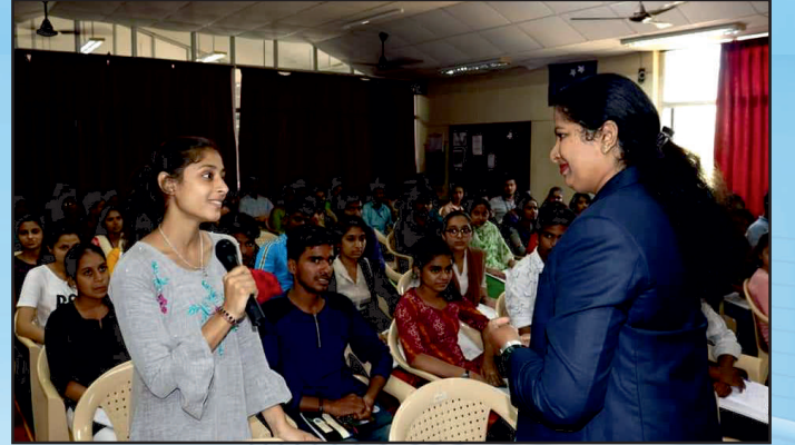
ಪಾರ್ಟ್ನೇಸ್ ವತಿಯಿಂದ ಸಂವಾದ ಕಾರ್ಯಕ್ರಮ